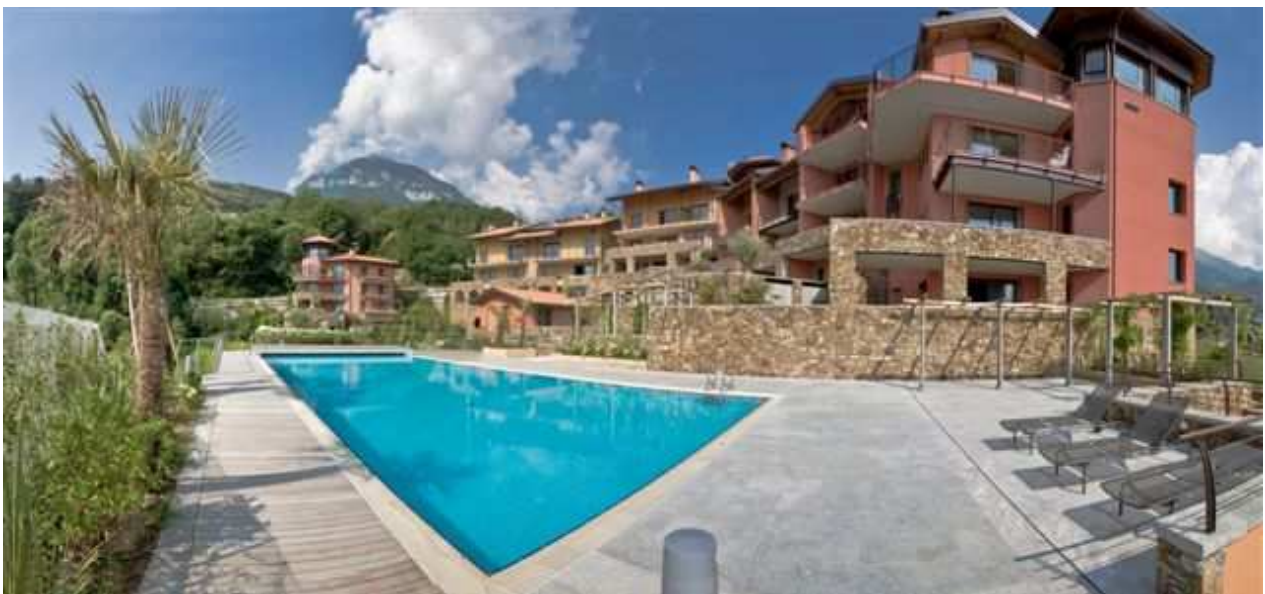
Residence B and residence C - Panoramic view .

Is still possible to adapt the apartment to your personal need as it is still possible to modify the lay-out of the apartments and to choose the fittings for bathrooms and floors according to your personal style.