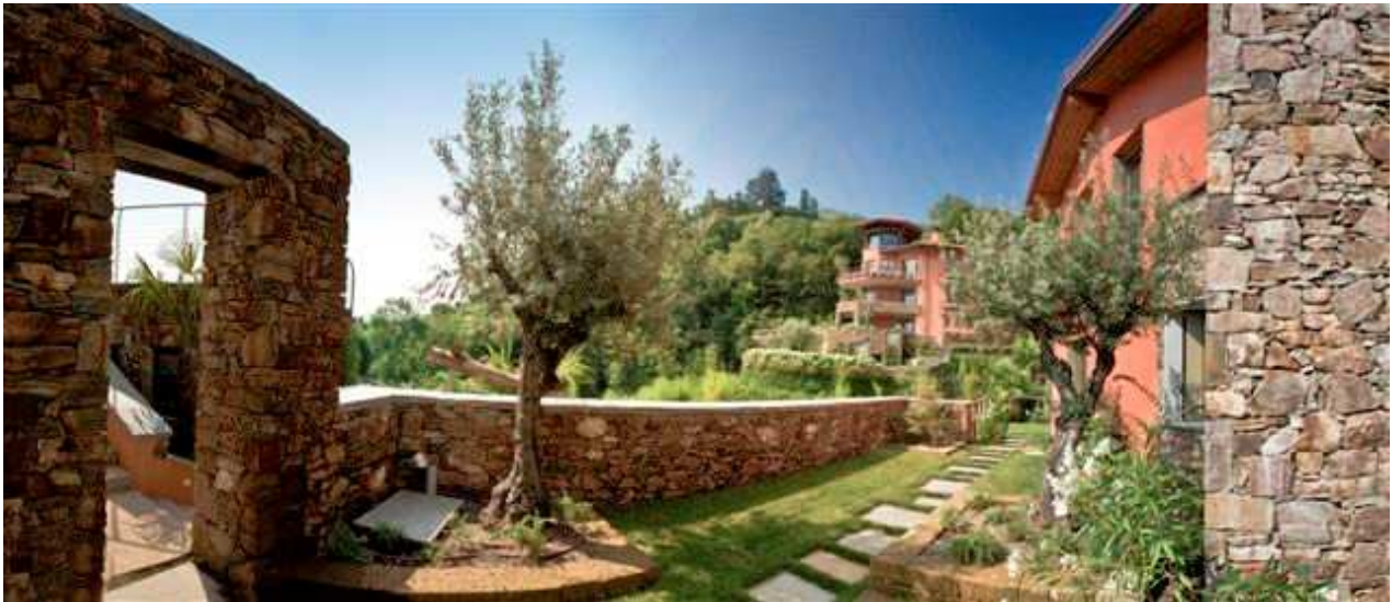
Private garden with view on residence C.